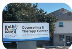
Boise Counseling & Therapy Center near St. Alphonsus Regional Medical Center.

Helping youth heal through proven therapies